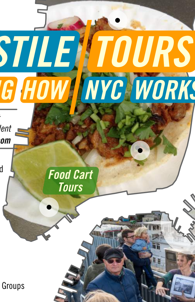
Food Cart Tours